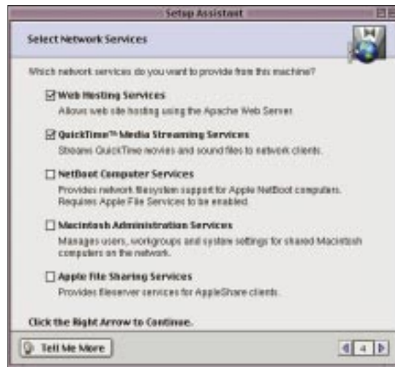
Configuring a server is fast and simple with the Setup Assistant included with Mac OS X Server.

Mac OS X Server also provides powerful, scalable file-serving capabilities, capable of supporting thousands of open files and over a thousand concurrent users. Authorized users can access files from any AppleShare client over TCP/IP or AppleTalk. User and group information can be shared among multiple servers, and everything can be managed remotely using web-based remote administration tools.